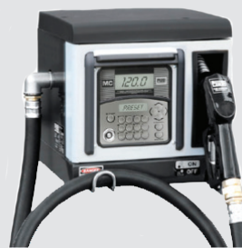
Piusi MC70 Fuel Management System